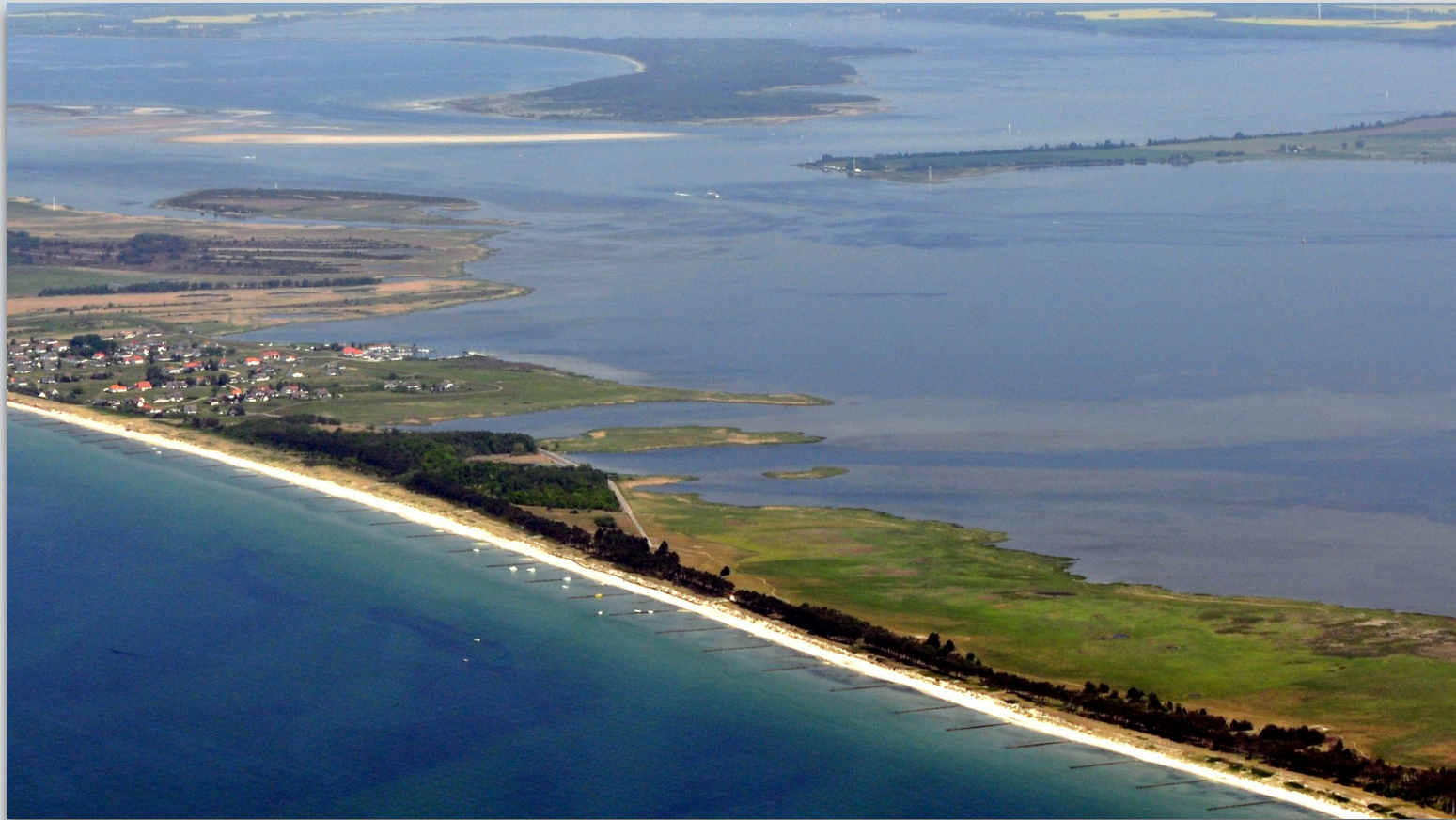
The South Shore