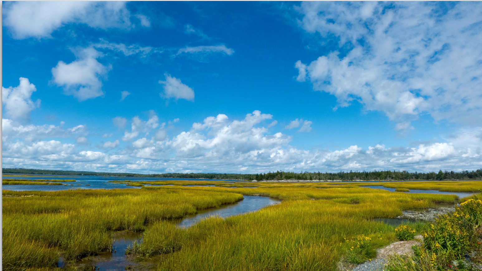
The Salt Marsh Community