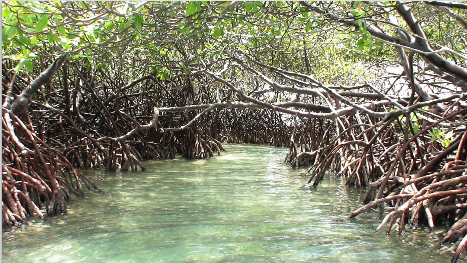
The Mangrove Community