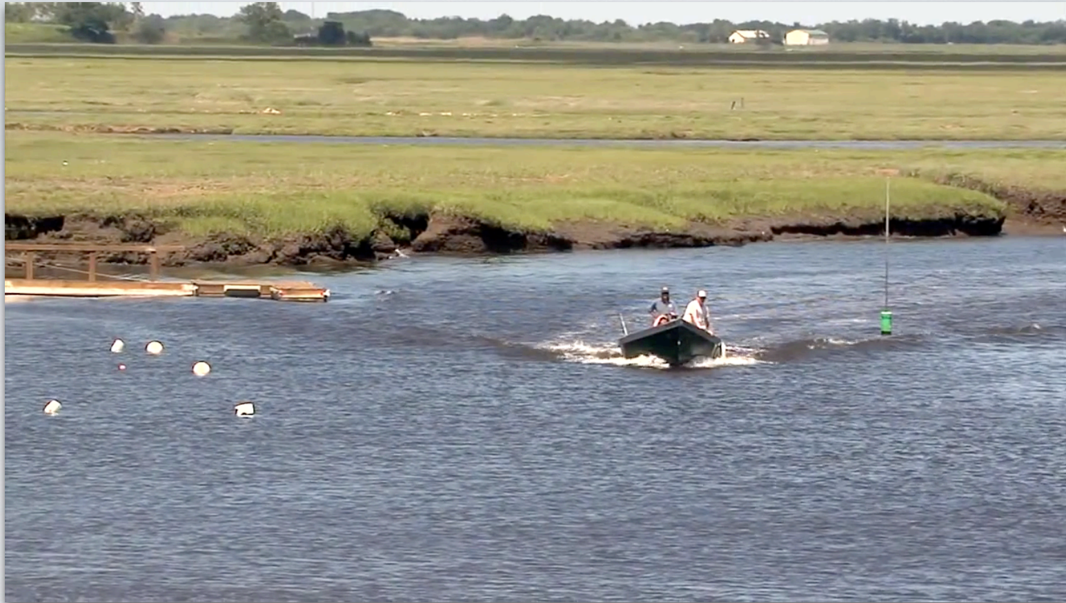
The Salt Marsh Community - Plumb Island