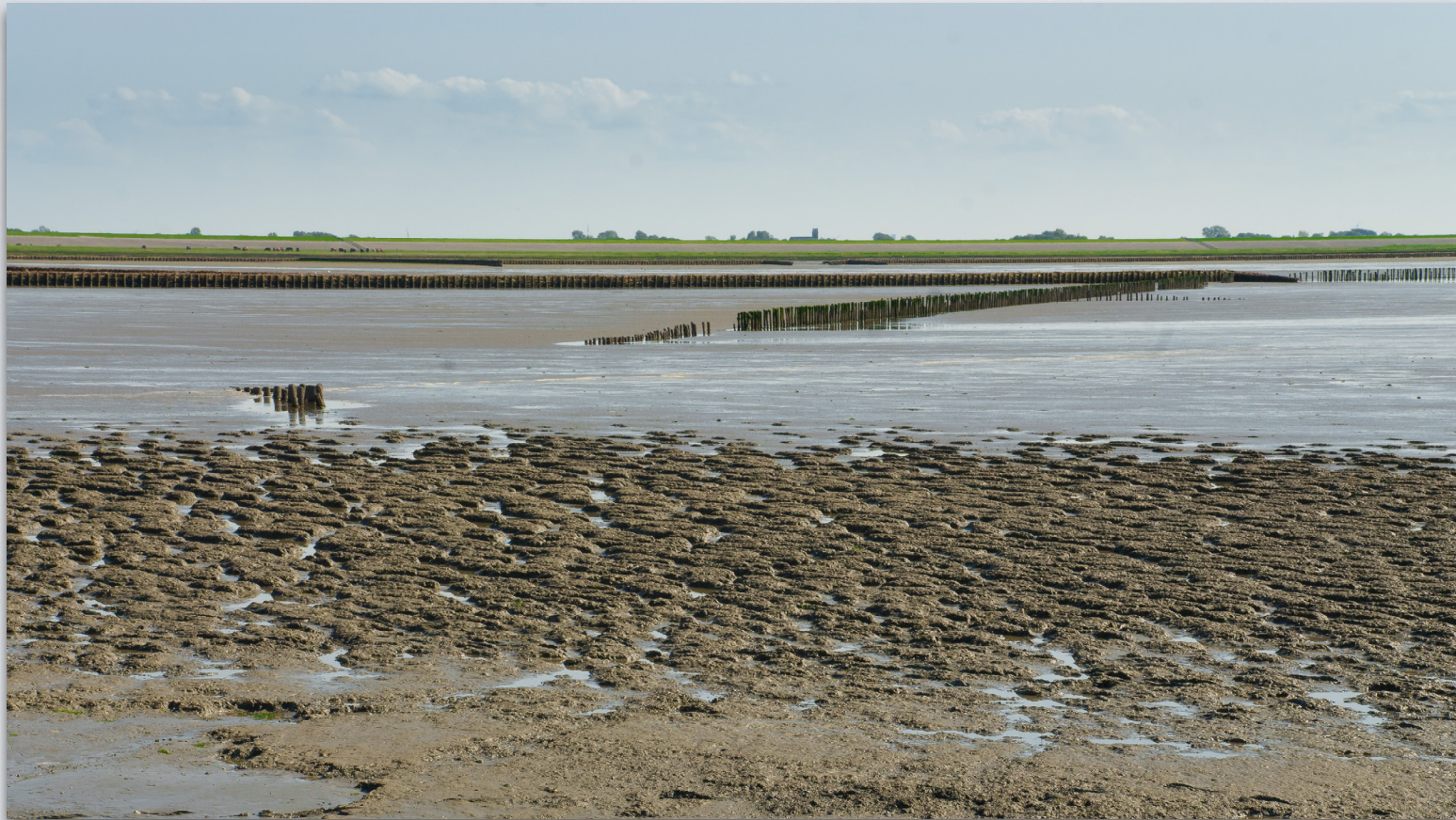
The Mudflat Community