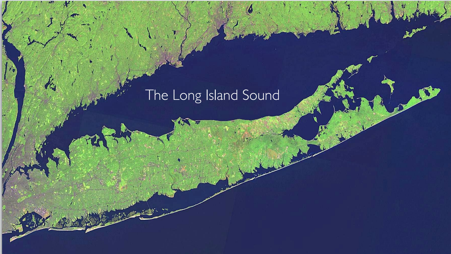
The Long Island Sound