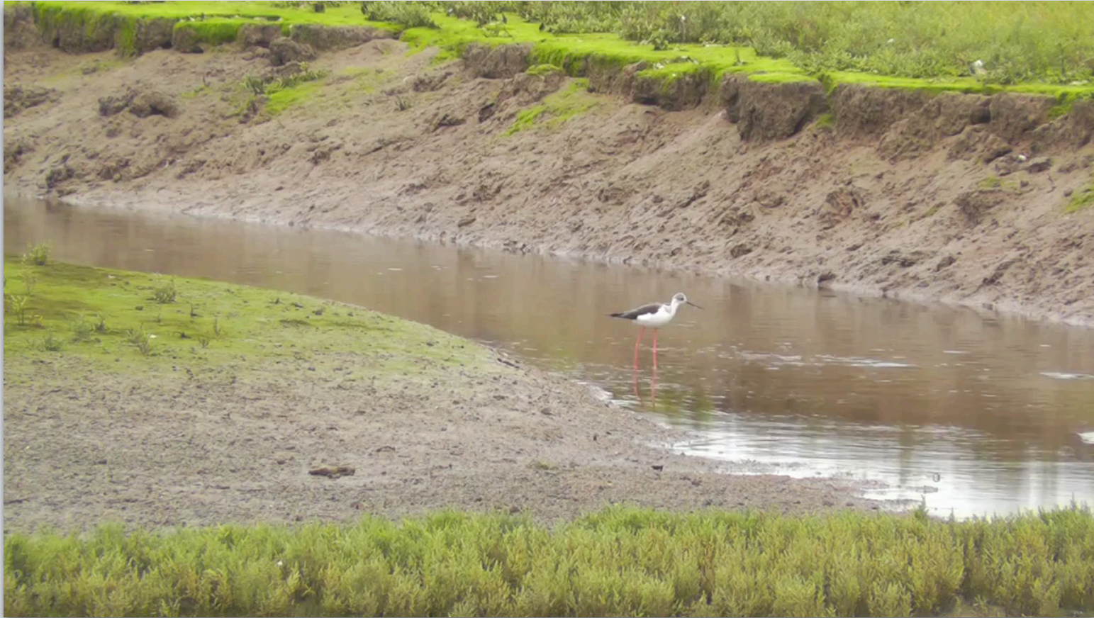
Life on the Salt Marsh - Black-Winged Stilt Bird