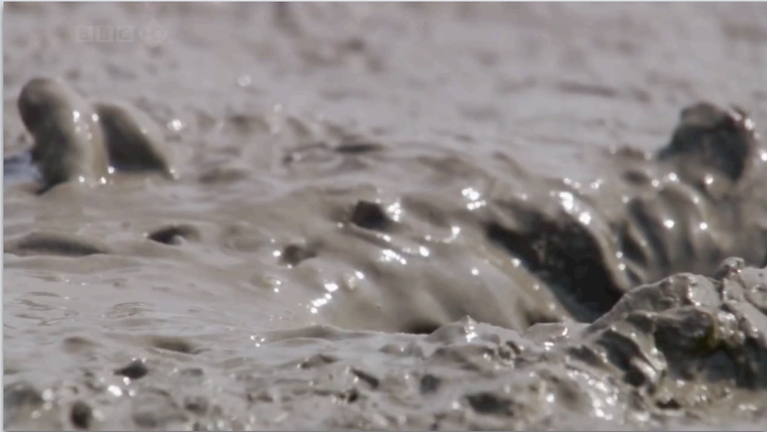
Life on the Mudflat - Mudskipper